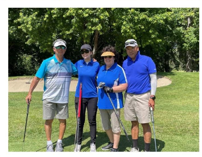
FUN WITH FRIENDS!

(more pictures on the BCF website: florinbuddhist.org)